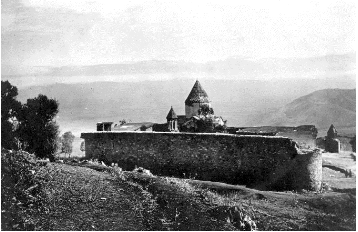
The Holy Apostles Monastery of Mush