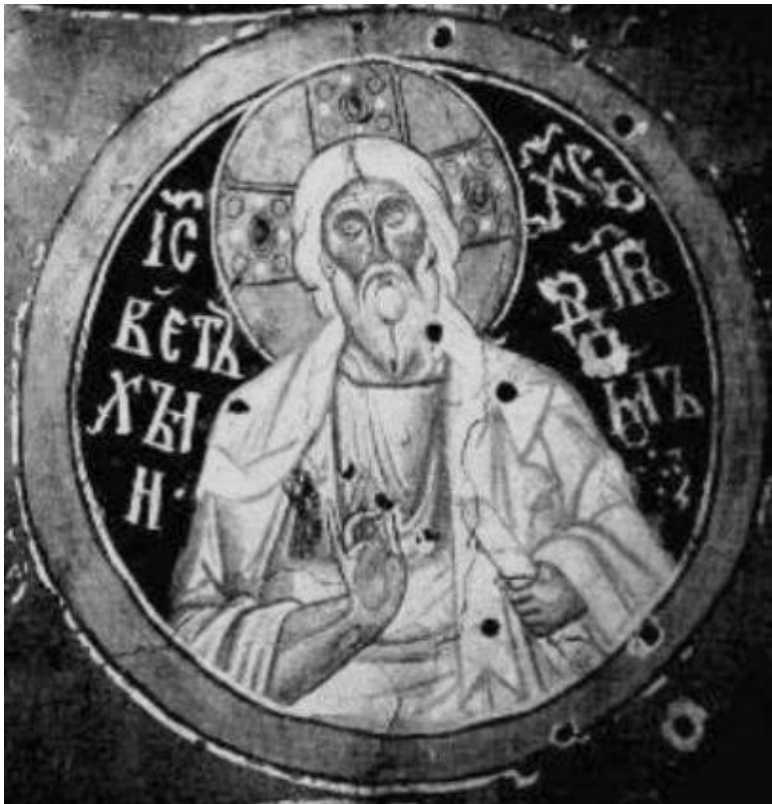
Jesus Christ – Ancient of Days. Russian fresco, Church of Pokrov on Nerl, 1199.

As God He is mentioned in the Revelation fifty odd times, as