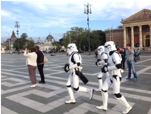
Budapest-Bratislava Two cities in one Weekend