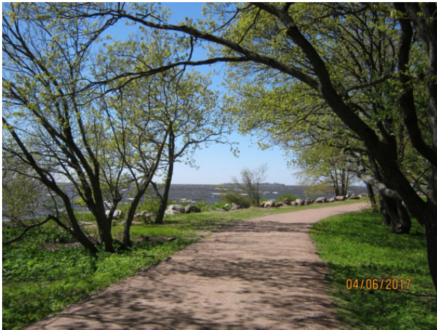
Sea landscapes of the park