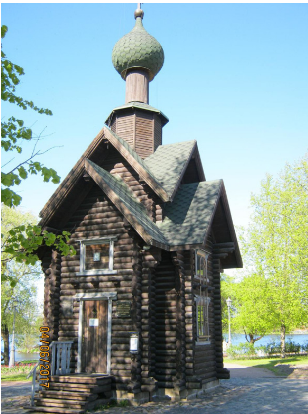
Chapel of the Prelate Nicholas The Wonderworker (view from the southwest)