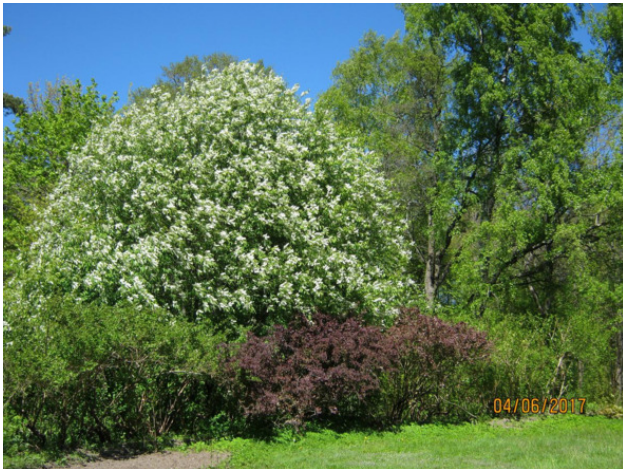
Bewitching views of the park