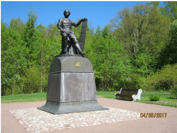
Monument to Peter I in the Distant Oaklets park