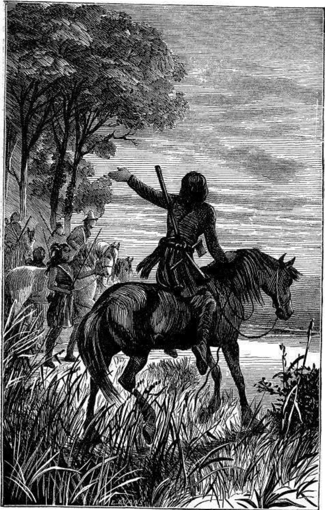
"We halted on the bank of a small river."