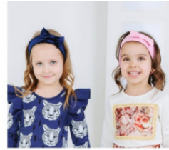
girls / children