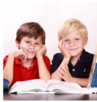
boys / children