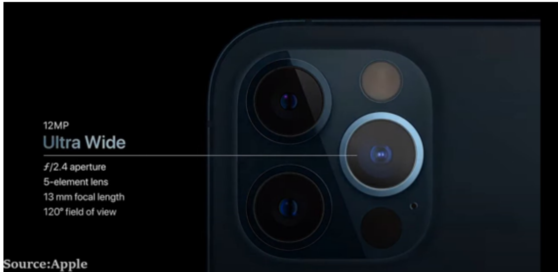
Figure 4: Identifying the 12MP Ultra-wide Lens

The ultra-wide camera has a 120-degree field of view that helps you in capturing extra-wide-angle shots.