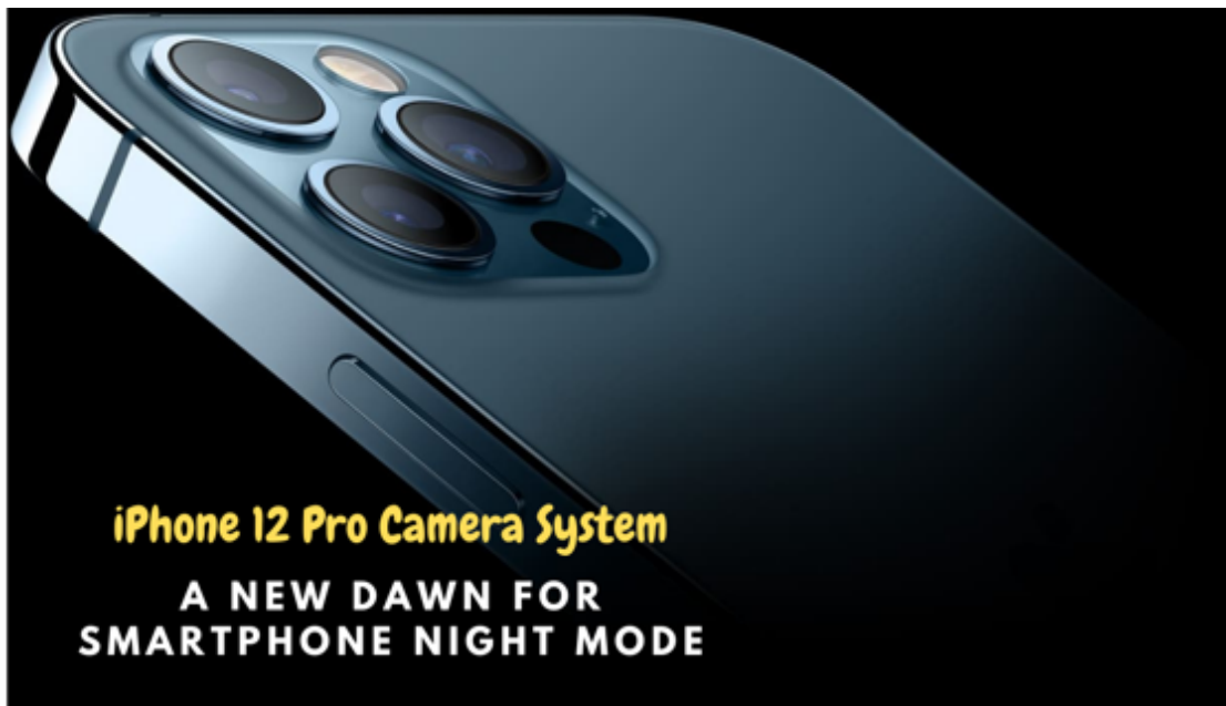
Figure 1: iPhone 12 Pro Max Lenses

Even though the whole lineup of the iPhone 12 series has got the best of the cameras in their respective segments, however, the iPhone 12 Pro Max has got such remarkable features that serious lovers of photography admire. Being a photography enthusiast, I tend to prefer the iPhone 12 Pro Max camera among the three, mostly because of its size and shape.