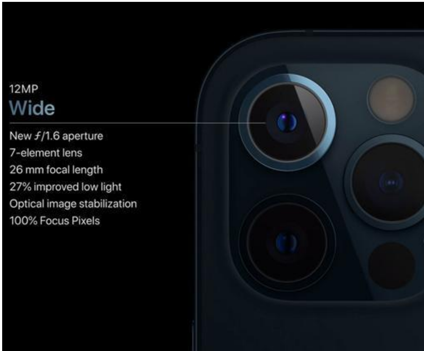
Figure 5: Identifying the 12MP Wide Lens

The wide camera has a 7-element lens with Sensor-shift optical image stabilization and 100 focus pixels.