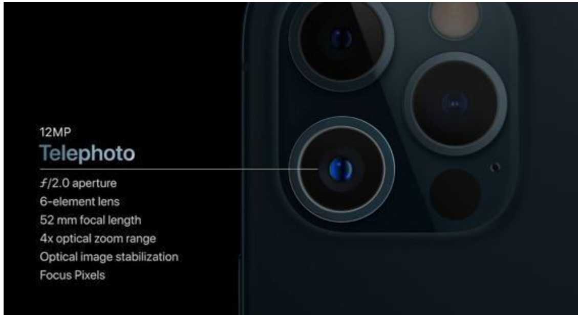
Figure 6: Identifying the 12MP Telephoto Lens

The telephoto camera is for taking stunning portraits and square pictures. It consists of a 6-element lens.