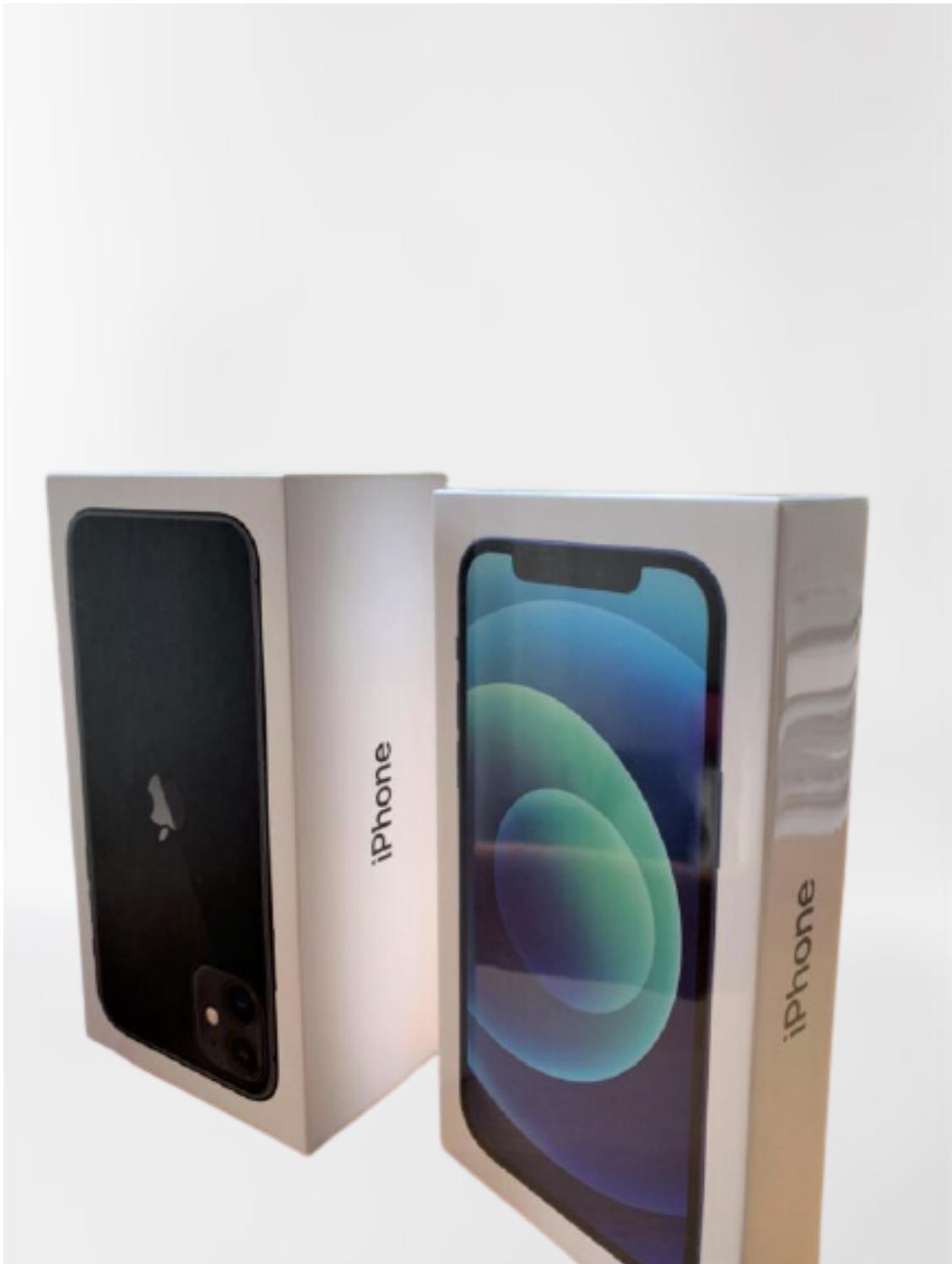
Figure 2: Unboxing the iPhone 12 Pro Max

According to Apple, the iPhone 12 Pro Max is made from the toughest glass ever to grace the glass body of a smartphone and offers an amazing resistance to dust and water with its IP rating of IP68, which helps to improve its reliability and durability.