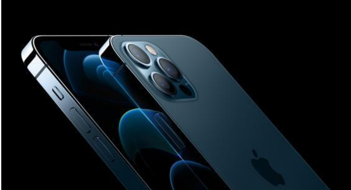
Figure 7: iPhone 12 Rear Cameras

The camera hardware is powered by the super A14 Bionic with a new image signal processor, which helps in improving image quality and other popular photography features that are not possible with general cameras. It also includes the Apple Pro Raw, which allows users to exercise better control over colors, details, and dynamic range on the iPhone or other photo editing apps.