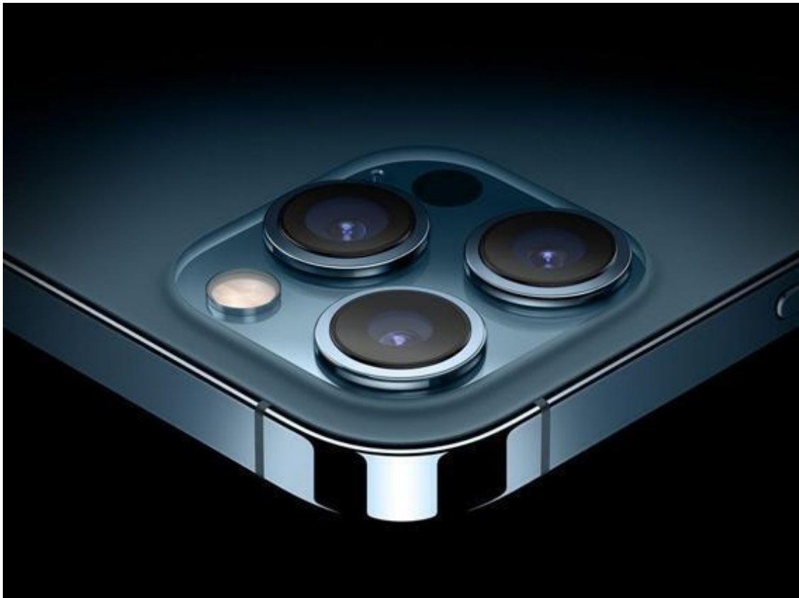
Figure 10: Triple iPhone Camera Array

The ultra-wide-angle camera can capture up to six times more scenes compared to what the standard wide-angle lens can capture from the same distance from the subject, which makes it a good way of capturing architecture images, landscape photos, tight shots, group pictures, and many other creative pictures.