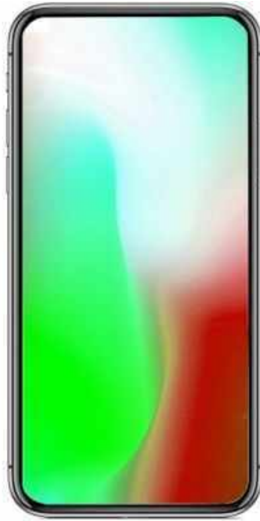
Figure 9: iPhone Screen Display with Resolution

The iPhone 12 Pro Max shares similar physical attributes as its predecessor iPhone 5s but has a noticeable camera bump on its back that houses the triple camera array, which is not present on the iPhone 5s but was introduced in the iPhone 11 series.