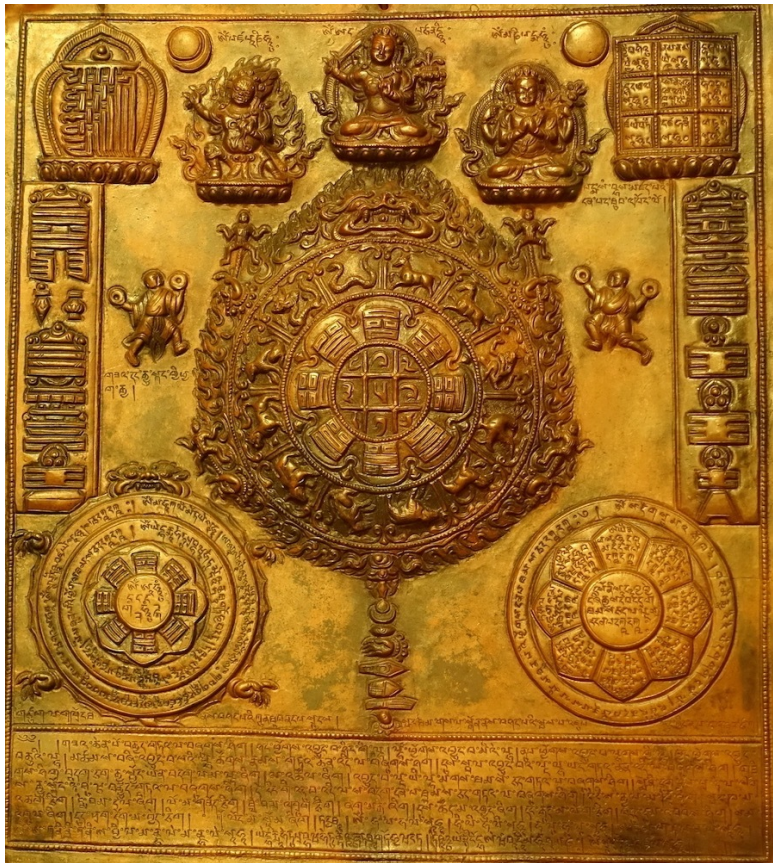
Tibetan astrological tanka, XIX century